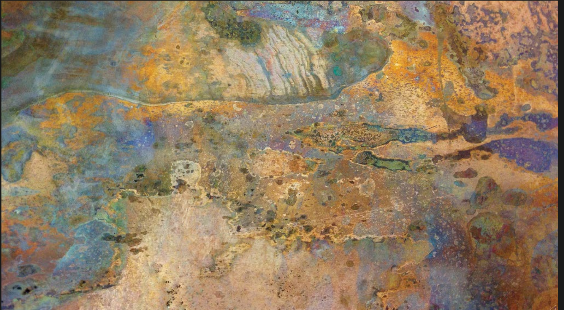
SHIFTING LANDSCAPE IV print on aluminium plate 25 x 45 x 3 cm | 2013/2017