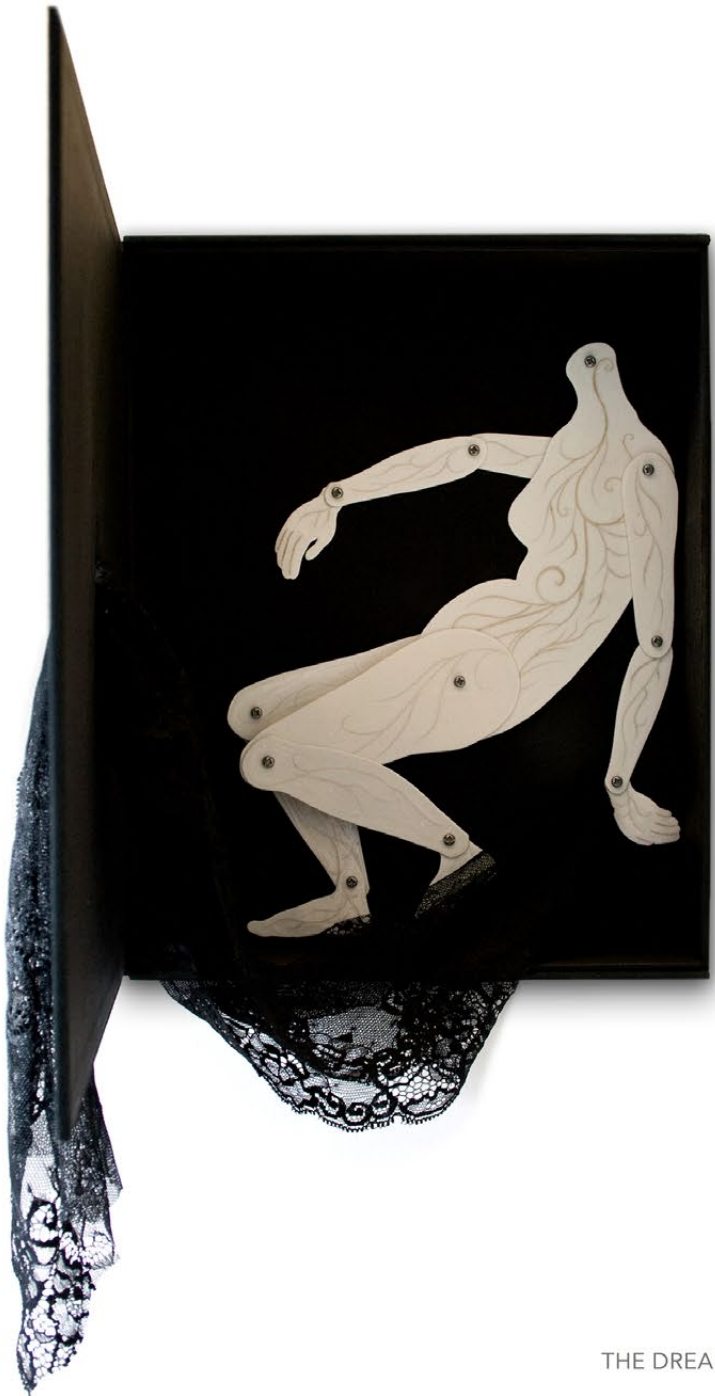
THE DREAM ARCHIVES Portal #019

porcelain, mixed media, KOLO Havana Box | 2.75 x 12. x 9.75 inches | 2009