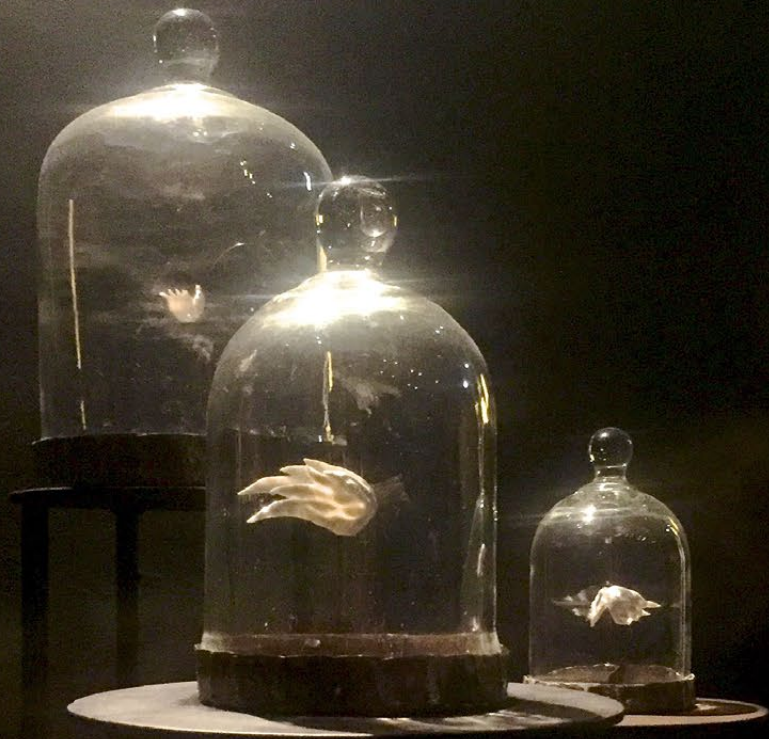
LIFE FORCE : Ricochet II porcelain, copper, tin, glass on iron pedestals 2014/2017