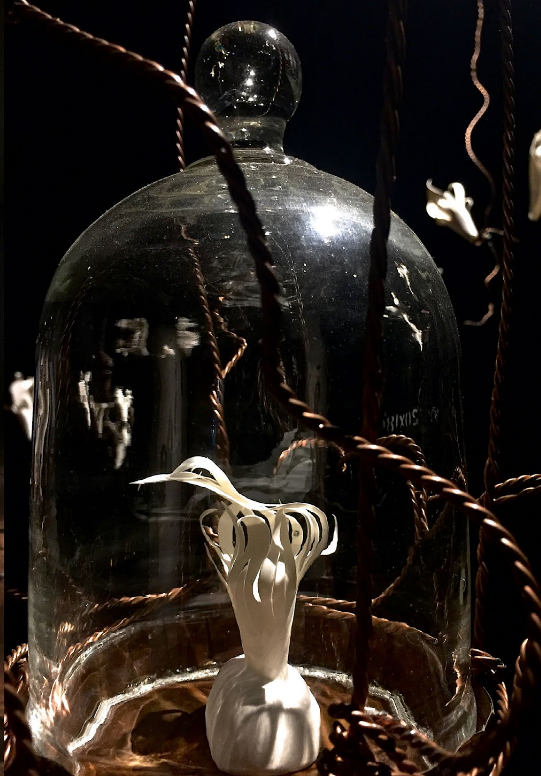
LIFE FORCE II : an installation porcelain, copper, tin, glass, lights | 2015/2017