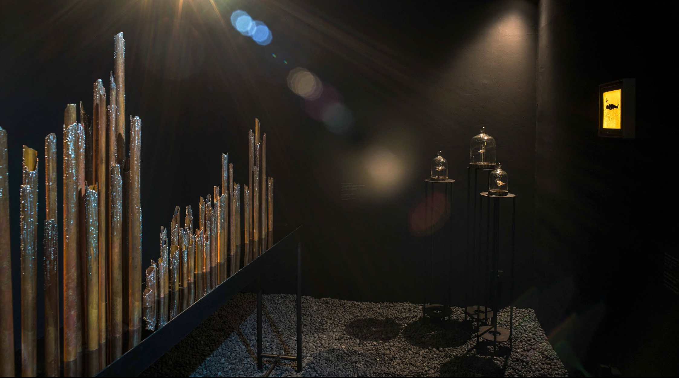
a view from LIFE FORCE : a solo exhibition | Dia.lo.gue art space, Jakarta, 2017