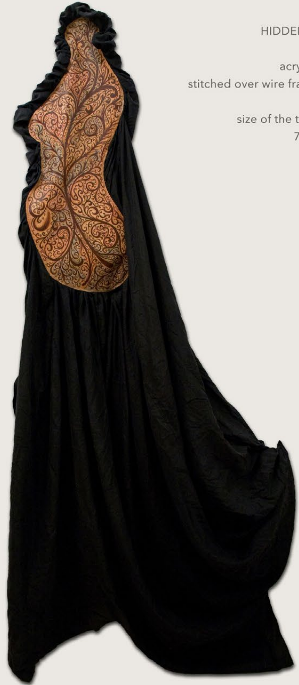
HIDDEN GROWTH II

porcelain, mixed media, KOLO Havana Box | 2.75 x 12. x 9.75 inches | 2009