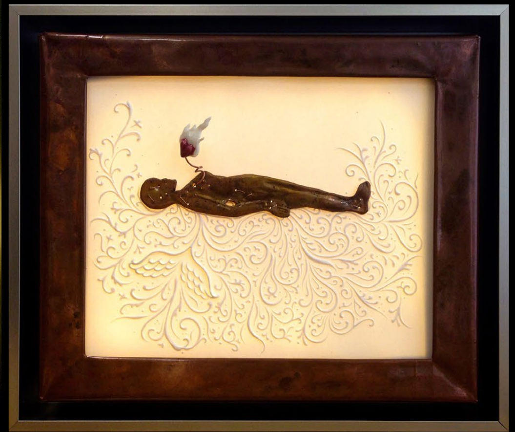
LIFE FORCE : Dormant porcelain, copper, LED light 35 x 31 x 4.5 cm 2013-2014